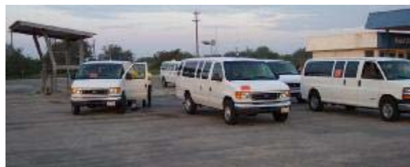
(Left) SAG Vans waiting for riders to pass their point on Sunday AM.