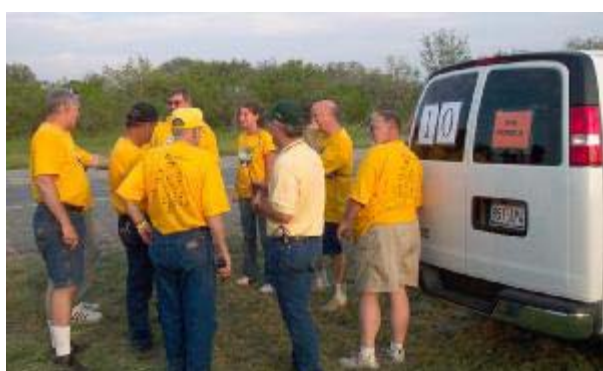
(Left) SAG drivers gather behind SAG10 for a briefing prior to hitting the road. All drivers wore the golden yellow shirts, while the officials wore lighter yellow or green shirts, depending on their assignments.

SAG drivers had to listed and operate on 2 different frequencies simultaneous, VHF and UHF. SAG to SAG and SAG to Break Point was on UHF, while Net Control was on VHF. 3 different repeaters were used to cover the course.