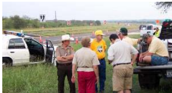
(Right) Hams wait for the riders to catch up and clear the Break Points.