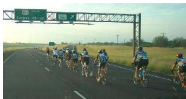
(Above) Riders on the road to Corpus Christi, following Hwy 181 from Beeville starting point on Sunday morning.