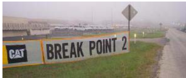
Foggy Morning, Break Point 2 the scene of SAG vans getting ready to hit the road. 25 SAGS all driven by Ham Operators.

I've included the latest version of the Ham assignment sheet, rather than reproducing the list of operators in this article. Instead, I'll conclude this article with a series of photos taken during the event. Hundreds of more photos may be viewed on-line at www.sanantoniohams.org web site.