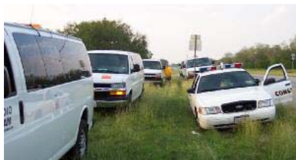
SAG vans and Safety Officer car on side of the road waiting for riders. (Below) Curtis N5QPN with Constable who was "Safety1" on the radio.

SAG drivers had to listed and operate on 2 different frequencies simultaneous, VHF and UHF. SAG to SAG and SAG to Break Point was on UHF, while Net Control was on VHF. 3 different repeaters were used to cover the course.