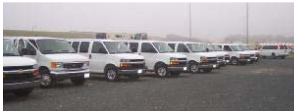
Nobody got mixed up on which van was their van, because we put big numbers on them to easily identify them.